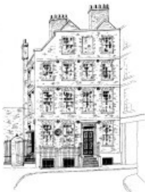
Dr Johnson's House